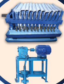
Plate Filter Machines